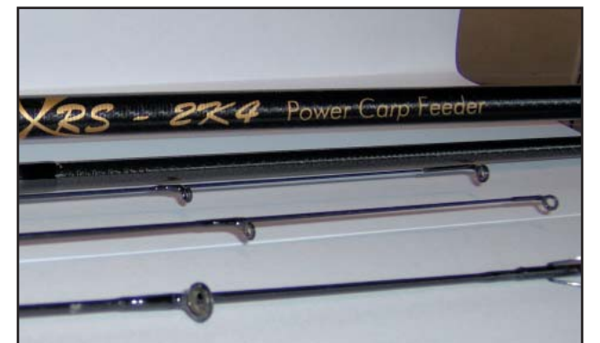
THREE TIPS: The rod comes supplied with an ultra-fine tip, a medium-heavy tip and a swing-tip adaptor

With a very reasonable RRP of £119.99, this rod is a perfect year-round commercial tool which has all the power needed to match the carp, while keeping the sensitivity to catch the silvers – an excellent rod!